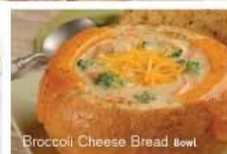
Broccoli Cheese Bread Bowl